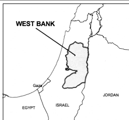
The above maps are from the UN Office for the Coordination of Humanitarian Affairs, July 2004. Not shown is the planned route of the barrier several kilometers east of the River Jordan and Dead Sea.