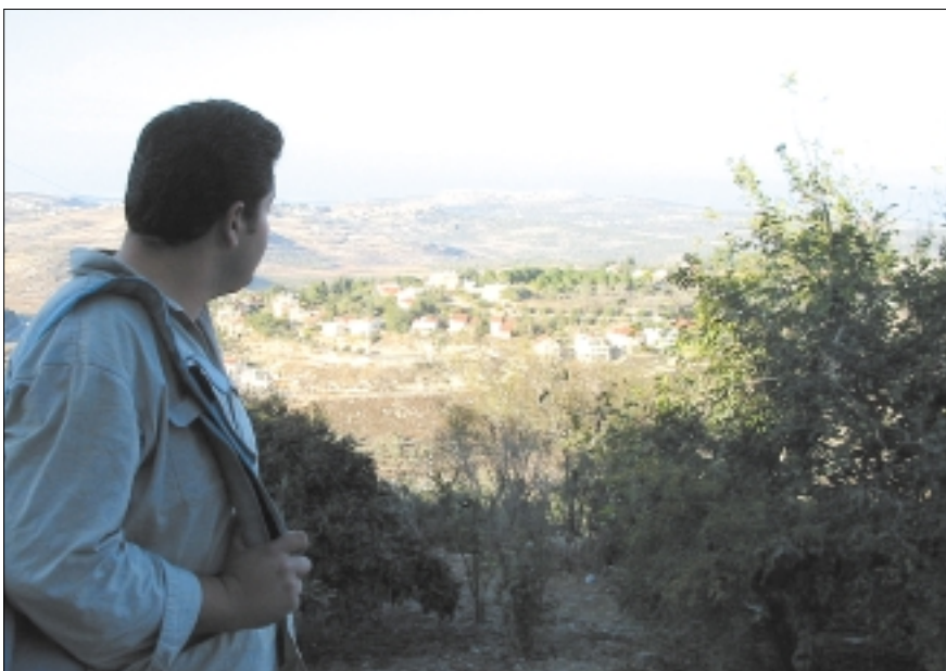
Establishing "facts on the ground," Israel has established settlements throughout the Occupied Territories like the one seen here below the West Bank village of Jit.

But wait. There was a fire in Fredericton North last night. A suspicious fire that's being investigated in case terrorism is a factor, and for now no one is allowed in or out of the city. And so you return home, only to find your orchard torn up to build a security