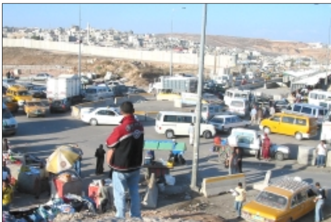
Five times longer and up to twice as tall as the Berlin wall, Israel's separation wall, seen here behind the Qalandiya checkpoint between Jerusalem and Ramallah, all but ignores the internationally-accepted Green Line between Israel and the Occupied Territories.

Look: A small knot of Israeli soldiers stands in the narrow cobblestone street in front of the Damascus Gate leading down into the heart of the Arab quarter of the