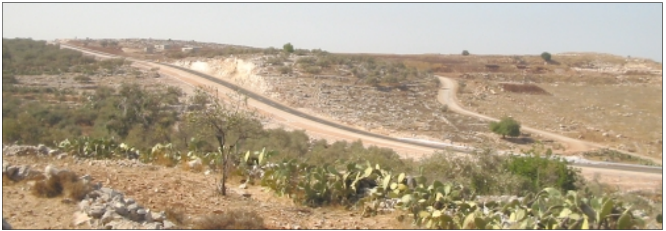
Israel's contested separation barrier runs through a Palestinian olive grove depriving farmers access to trees on the far (right) side.