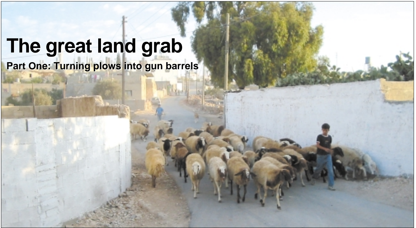
Young shepherds lead sheep and goats to pasture near Qbdya, Palestine, a village famous for a Sharon-lead massacre in 1953.

Imagine you are farming in the rolling hills east of Fredericton, N.B. It's the year 2020, another dry summer, but here anything grows if you have water for irrigation.